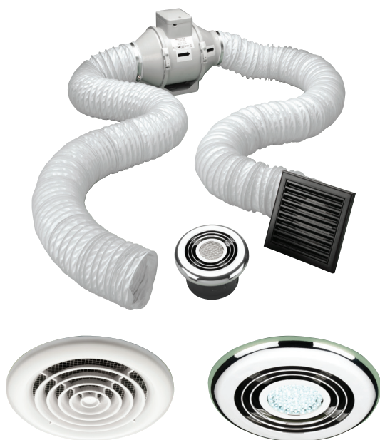
Cyclone - non-illuminated

These kits include 3 metres of flexible Ø10cm ducting, a fixed grille, and 2x steel hose clamps. Compatible with Breeze and Hush fans.